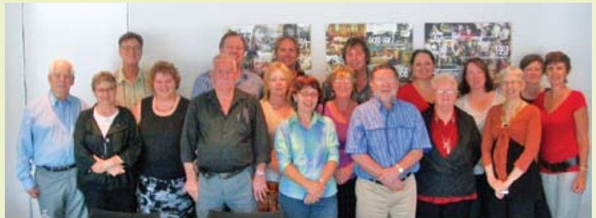
This picture shows the current membership of the Alliance for Forgotten Australians (AFA) at our recent (8–9 February 2010) meeting in Melbourne. AFA promotes the interests of Forgotten Australians through advocacy and educates the community through awareness-raising projects.